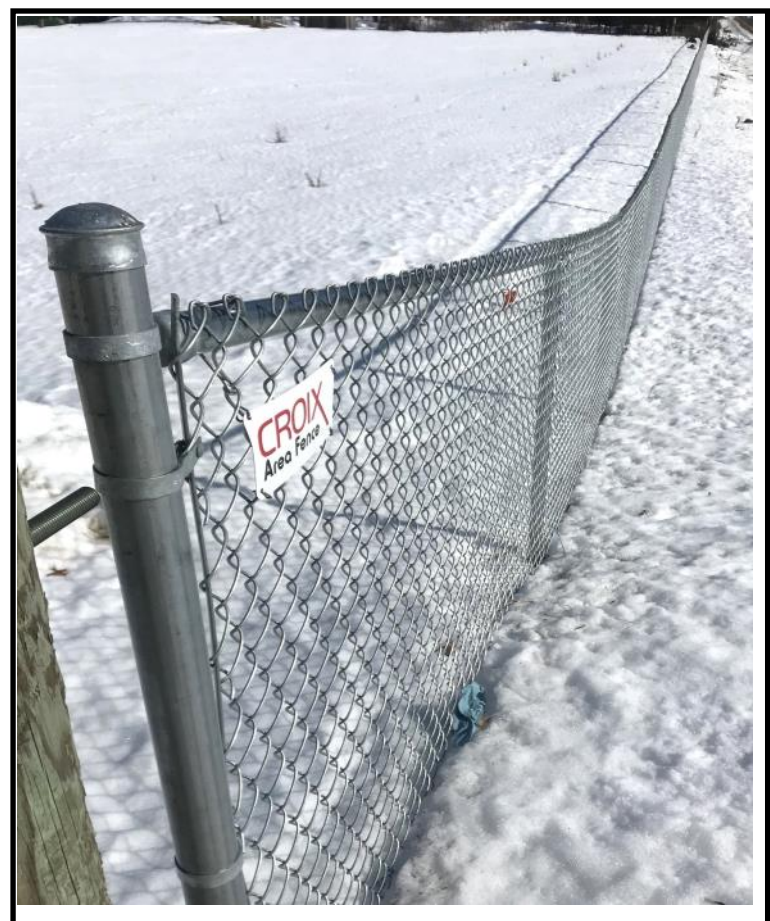
New fence installed

Several hundred feet of new cyclone fence was completed in December, securing the southside and gate to the new RFSC acreage.