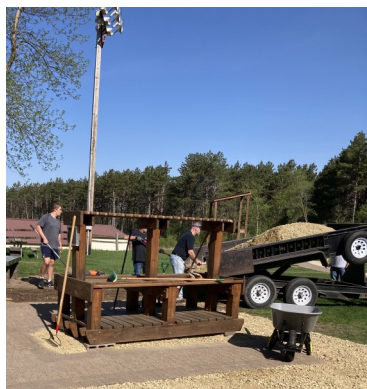
New gravel near the gun racks was part of Spring clean-up day.